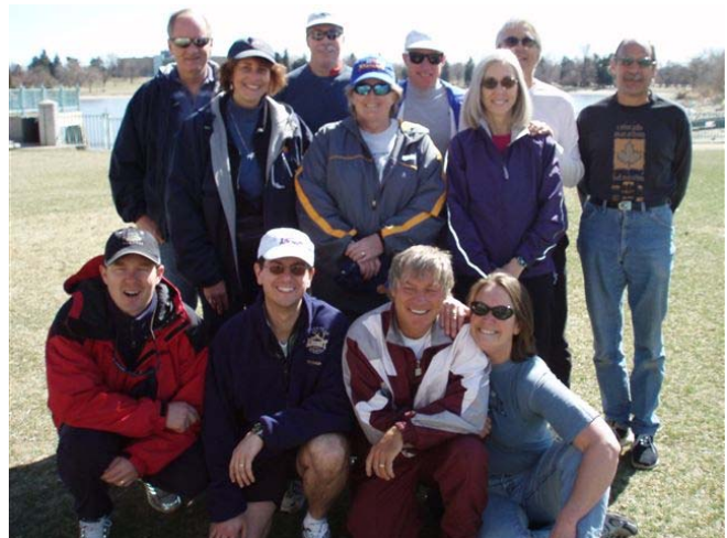
It takes more than a village. It takes a lot of dedicated, hard working people. Thank you April Trophy Series Volunteers!!