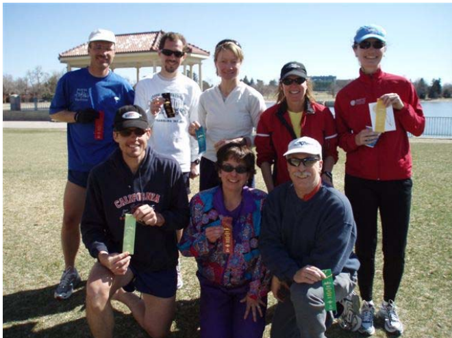
Congratulations April Trophy Series Winners